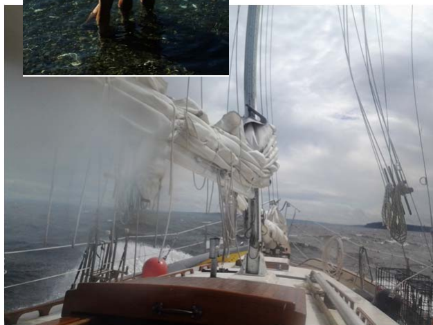
Rough waters outside of Port Ludlow on Thumper