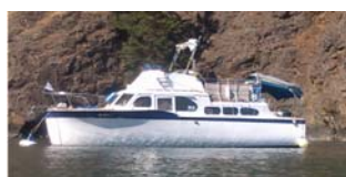
SeaStar and crew enjoyed a wonderful 10 days in the San Juan Islands!